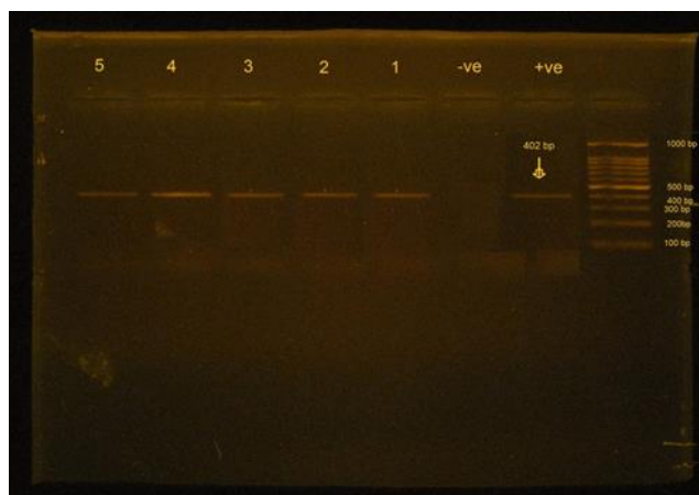
Fig. 4. Five examined field isolates were identified as C. perfringens type A (alpha toxin) giving a characteristic band at 402 bp