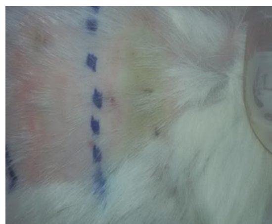
Fig. 3. Necrotic dermatitis in guinea pig showed C. perfringens type A.