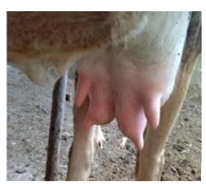
Fig. 7: Teat obstruction