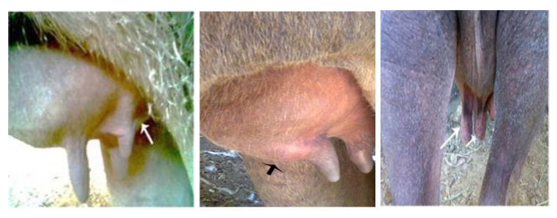
Fig. 29. Mastitis