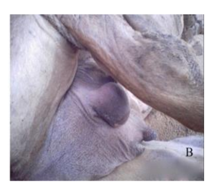
Fig. 38. Teat obstruction