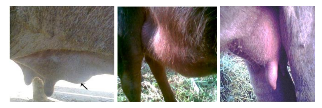
Fig. 26. Udder subcutaneous abscess Fig. 27. Udder edema