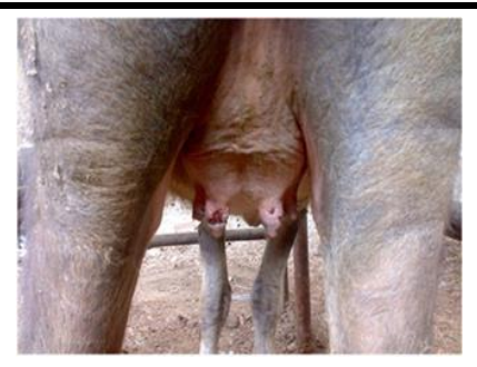
Fig. 32. Teat ulcers