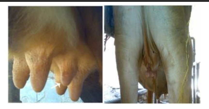
Fig. 1. hyper-mastia in a cow Fig. 2. Hypoplasia in a cow