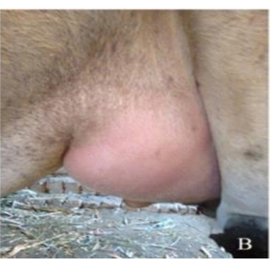
Fig. 37. Mastitis