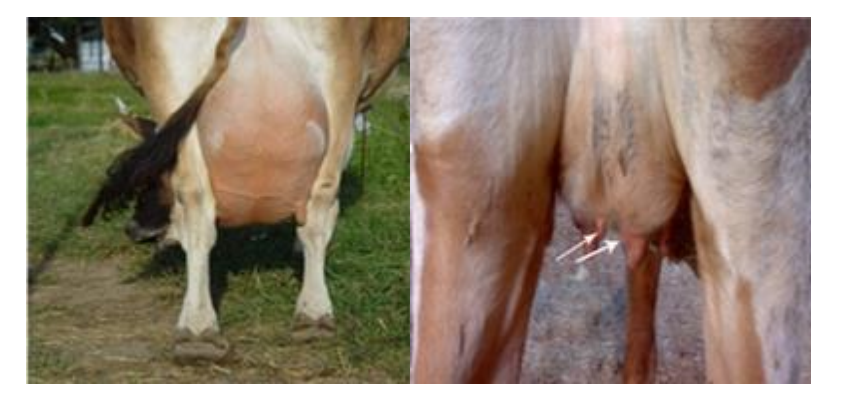
Fig. 3. A pendulous udder