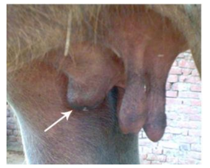
Fig. 34. Teat gangrene