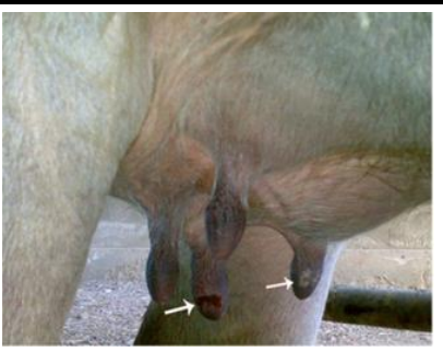
Fig. 33. Teat wound