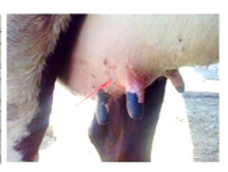
Fig. 13. Impetigo