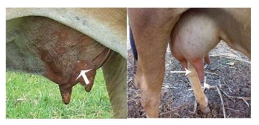
Fig. 5. Athelia