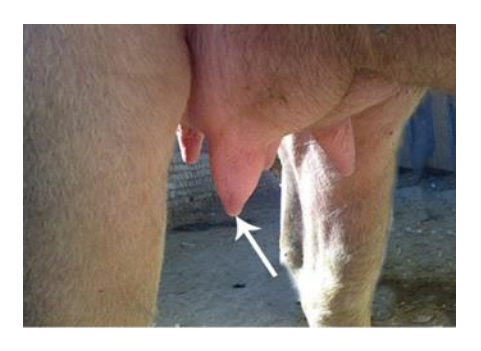
Fig. 36: Teat obstruction