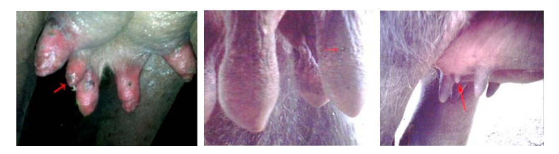
Fig. 23. Lactating quarter Fig. 24. Congenital fistula Fig. 25. Extra lactating teat