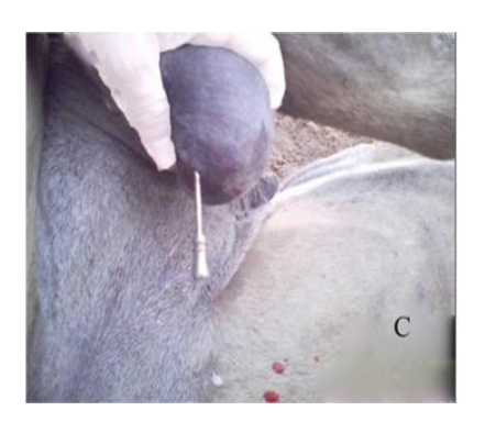
Fig. 39. Insertion of teat syphon