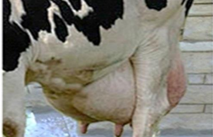
Fig. 12. Pendulous udder