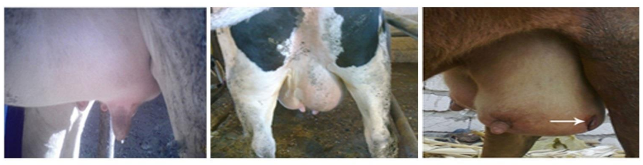
Fig. 8. Acute mastitis